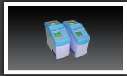
Druck Dry Block Calibrators Includes Temperature Source and Temperature Calibrator versions. View On-Line