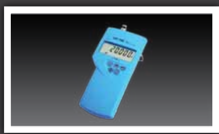
Druck DPI 705 Digital Pressure Indicator. With many features for maintenance and troubleshooting. View On-Line