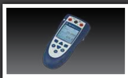
DPI822 Thermo/Loop Calibrator T/C output and mA measurement for transmitter and loop measurement. View On-Line