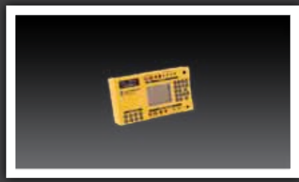
Druck TRX II IS A highly accurate and easy to use Intrinsically Safe documenting calibrator. View On-Line