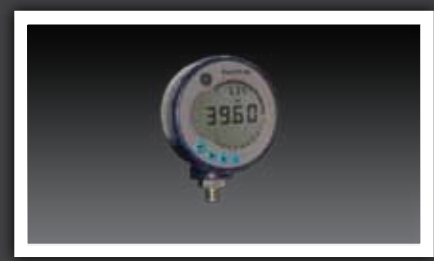
Druck DPI 104 A micro-processor controlled, network capable digital pressure gauge. View On-Line