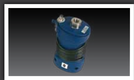
Druck IDOS Pressure Modules Universal Pressure Modules are available in ranges from 25 mbar to 700 bar. View On-Line