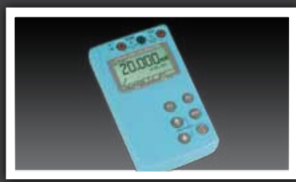
Druck UPS III Loop Calibrator An essential tool for loop testing, instrument maintenance and valve set-up. View On-Line