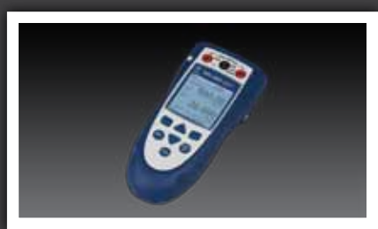
DPI880 Multi-function Calibrator An ultra compact and simple to use tool for testing, configuring and calibrating. View On-Line