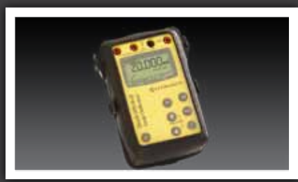
Druck UPS III IS An essential tool for loop testing, instrument maintenance and valve set-up. View On-Line