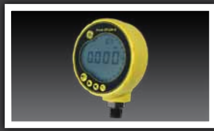
Druck DPI 104 IS IS version of the DPI 104 digital pressure gauge. View On-Line