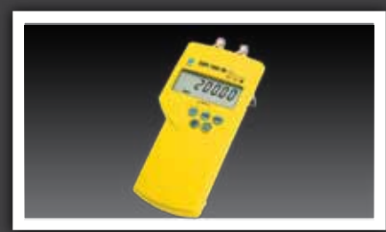
Druck DPI 705 IS Designed to determine moisture in oil and provide highly accurate results on-site. View On-Line